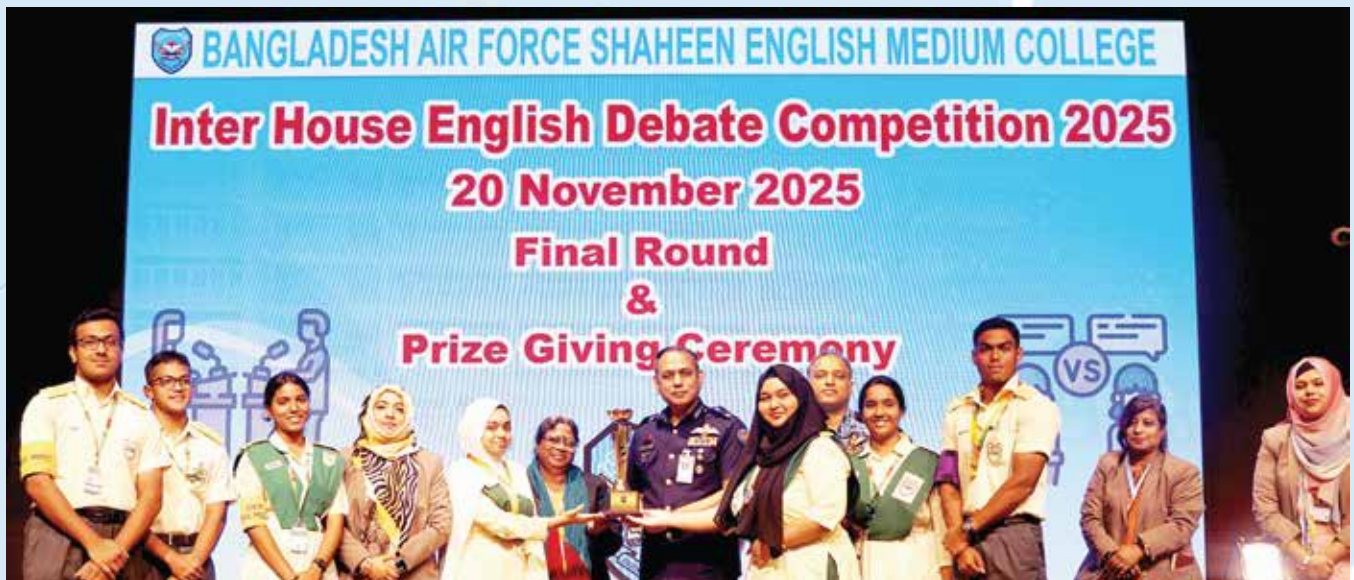
The Champion house proudly receiving the trophy from the chief guest