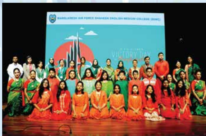
An assembly of the future of our nation