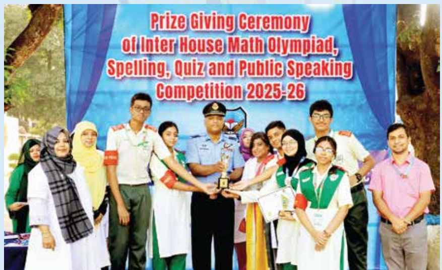
A well deserving trophy awarded to Mars House