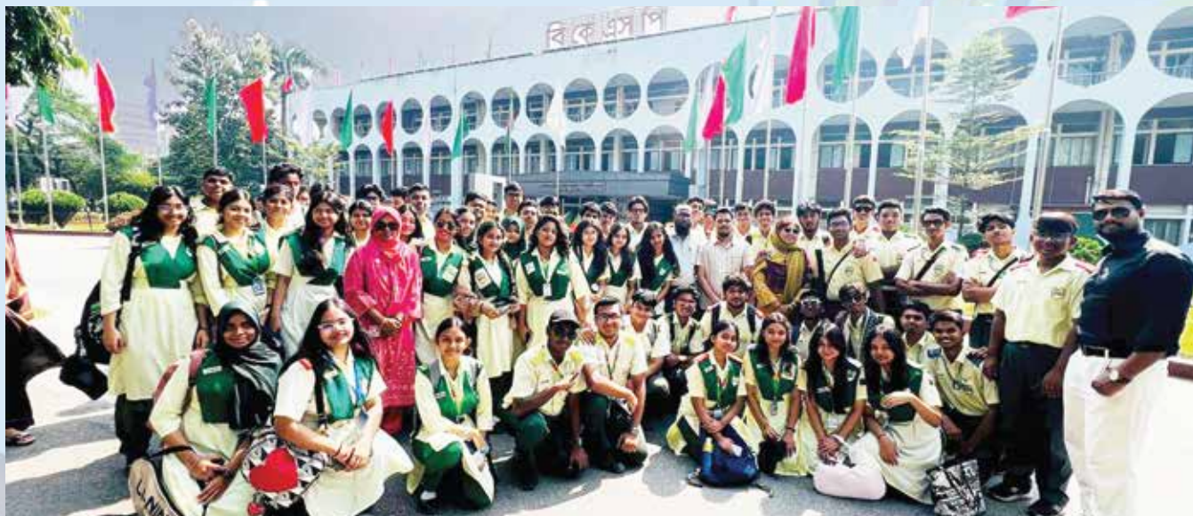
Education meeting adventure!