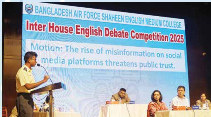
A confident debater presenting his arguments

The Inter-house English Debate Competition of 2025 unfolded on the 19 th and 20 th of November, uniting the four houses of BAF Shaheen English Medium College for two days of articulate arguments and sharp rebuttals. In the first match, Venus House competed against Mars House, with Venus advancing to the final. The second debate saw Mercury House face Jupiter House, where Jupiter House secured the second place in the Finals.