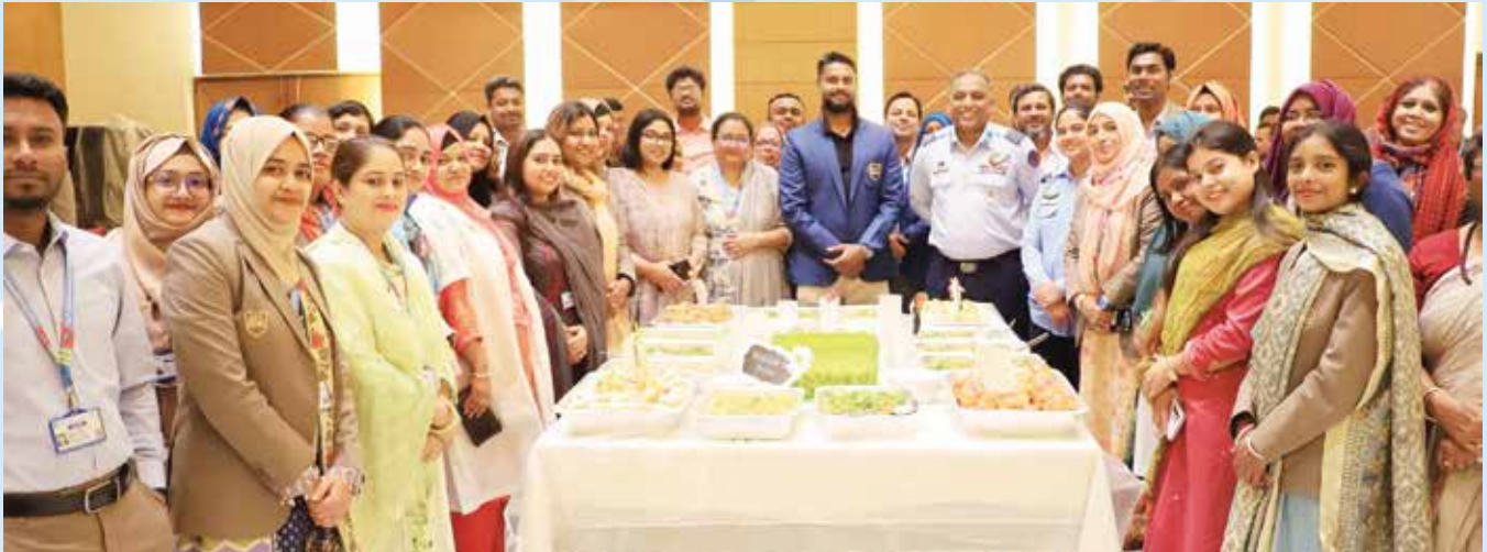
Warm smiles and a festive air!

The Teachers' Food Fest was held on 9th December 2025 in the Multipurpose Hall of BAF SEMC, graced by the presence of the Principal and the Adjutant as the chief guests. The event brought together three enthusiastic groups of qualified teachers, contributing to the grand success of the celebration.