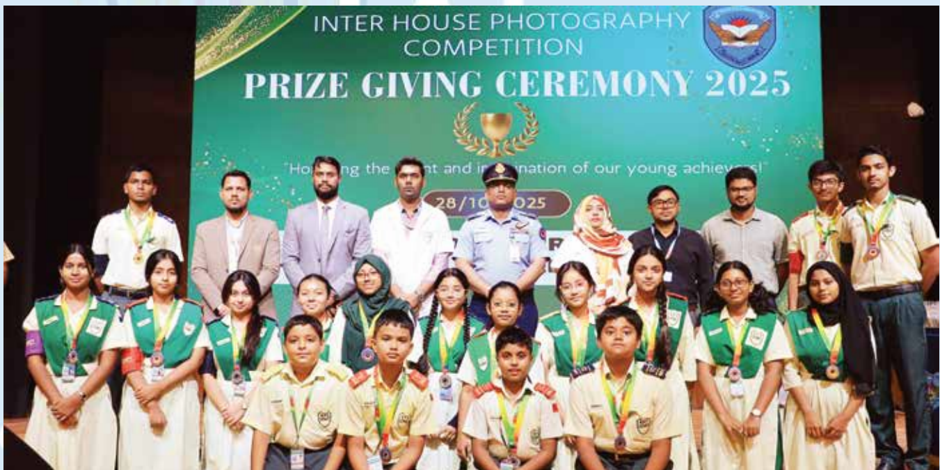
Photo session with the awardees