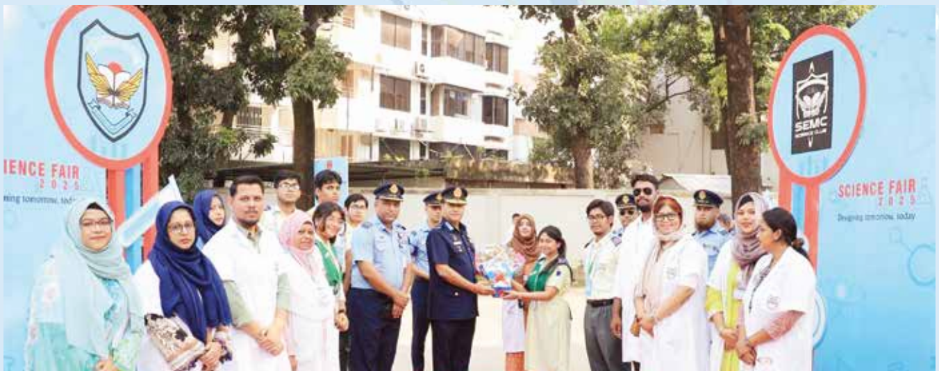
The chief guest being welcomed at the entrance

The students confidently and skillfully explained their ideas, leaving a strong impression on the judges. The competitive atmosphere further inspired participants to refine their projects for the second day.