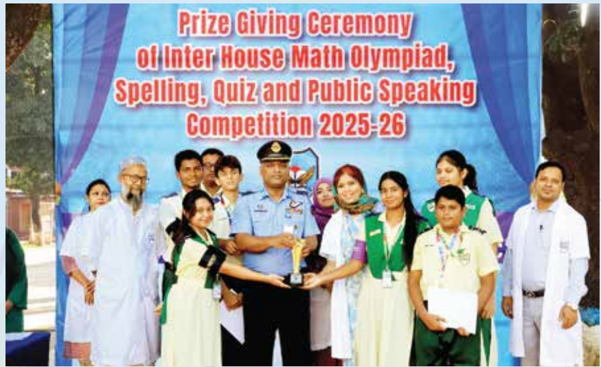
A token of glory earned by Venus House

Fest 2025, whose dedication and leadership played a pivotal role in the event's successful execution. The ceremony concluded with an address by the Principal, who congratulated all honourees, expressed appreciation for their achievements and encouraged students to continue striving for excellence in both academic and co-curricular pursuits.