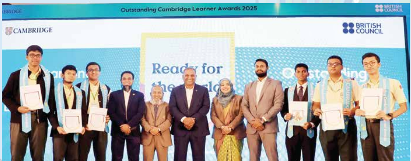
The rising stars on the podium of Cambridge Learner Awards

The remarkable results reflect the dedication and hard work of SEMCians and highlight the unwavering encouragement provided by the teachers, staff and parents to build these brilliant minds.