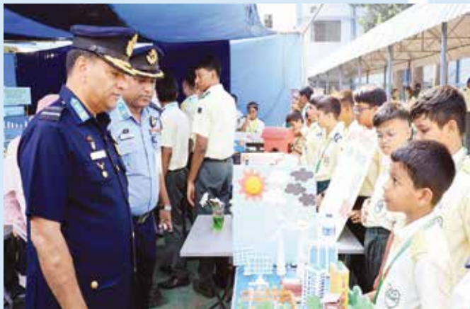
The primary group proudly showcasing their projects