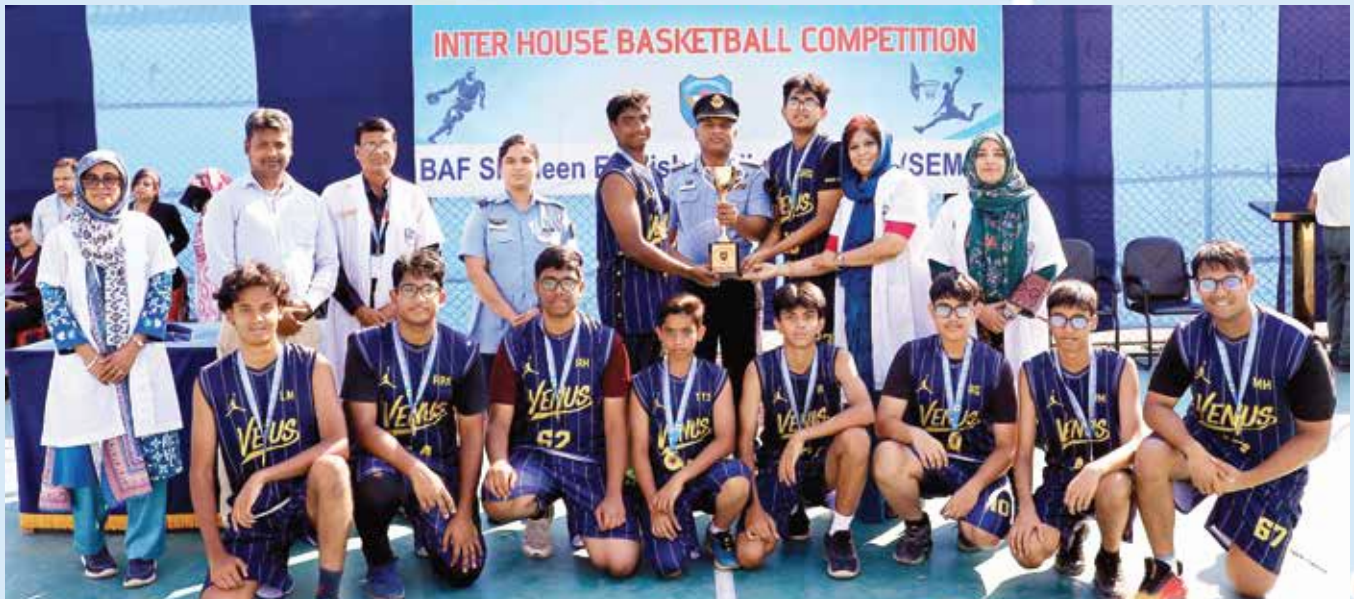
Venus House triumphs in victory