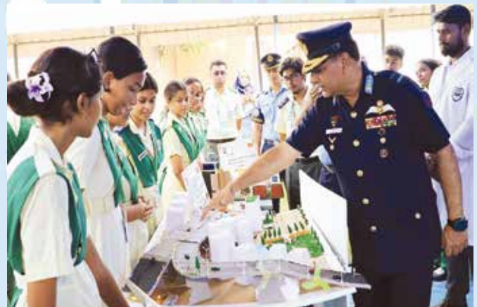
The chief guest keenly observing a project

The final day, held on 26 th October, began with a tour of the exhibition by the respected Chief Guest, AVM Syed Sayeedur Rahman, BUP, afwc, psc, along with other Air officials and judges. Selecting the top ten projects from each category was indeed challenging due to the remarkable talent and originality displayed by the students.