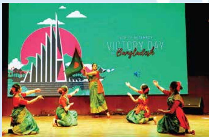
A dance of the young patriots

This memorable day concluded with an enlightening speech by the Adjutant, who once again reminded the audience of the undying passion and love our own people had, achieving freedom for Bangladesh.