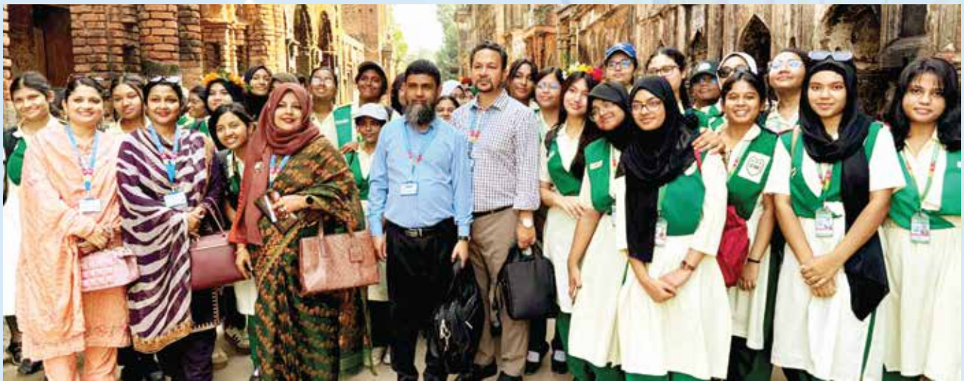
A captivating study tour of extravagance

Like every other year, BAF Shaheen English Medium College organized a study tour for the young minds of STD-X as a unique educational experience on the vibrant and sunny morning of 28 th October. After a long and awaited journey, the students reached the much-anticipated destination, Sonargaon, Panam City. The tour allowed the pupils to catch a glimpse of the lifestyle of our ancestors from the ancient buildings and their complex architecture, proving the contrast between modern and medieval times. Apart from gaining knowledge, the students also took pictures, holding memories that can be later reminisced. Overall, the tour was a wholesome remembrance for the students that created a stronger bond between the students and the teachers.