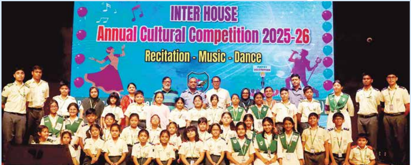
A well deserving trophy awarded to Mars House