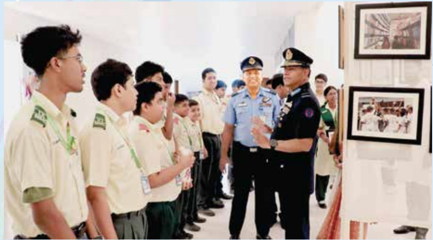
The chief guest inspiring the photographers

This brought Inter-house Photography Competition to an end, leaving students with a deeper appreciation for the creativity and skill behind every photograph clicked. In the end, Jupiter House proudly secured the champion title, while Venus House earned a well-deserved runner-up position.